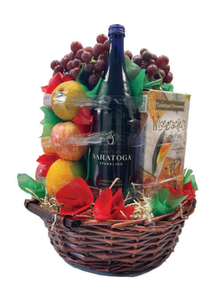
Festival of Fruit