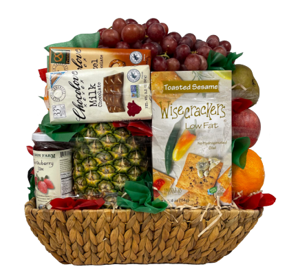
Parade of Fruit