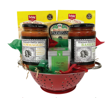
Gluten-Free Italian Dinner Basket

Looking for the perfect basket for a loved one that is Gluten-sensitive? Our Gluten-Free Italian Dinner Basket is packed with flavor and items for the perfect dinner including: Basilico and Formaggio pasta sauces, Schar's Spaghetti and Penne pasta, plus Belgioioso parmesan cheese and Victoria Taylor's Tuscan Seasoning. This basket also arrives in a colander to add that extra something to the gift.