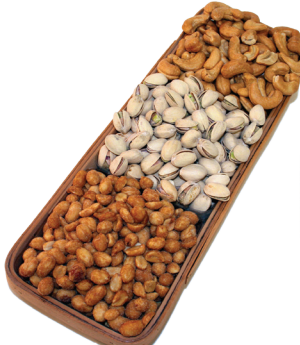
Roasted Nut Tray