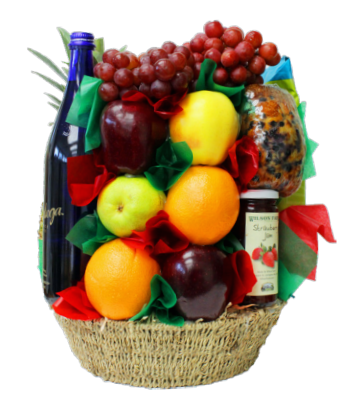
Medley of Fruit