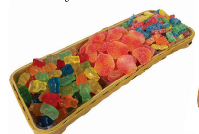
Classic Candy Tray

Contains a selection of 4 candy varieties. Over 2.5 pounds of candy.