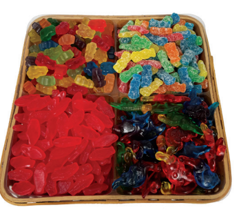
Large Classic Candy Tray