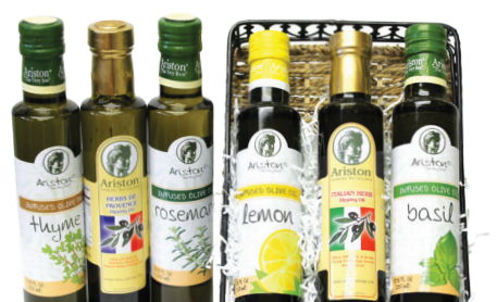
Olive & Dipping Oil Collections