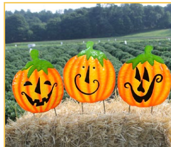
Tin J-O-L Yard Art

20" - Item No. 10-3085-01 Assortment of 3 | Pkg. 24 | $2.00