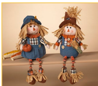
15" Plush Scarecrow Shelf Sitter