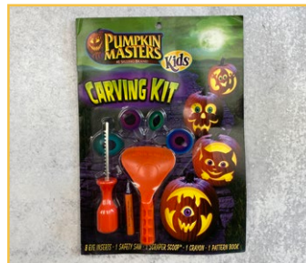
Kids Carving Kit