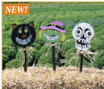
19" Funky Face Pick

Item No. 10-3082-5 Assortment of 4 | Pkg. 24 | $2.25