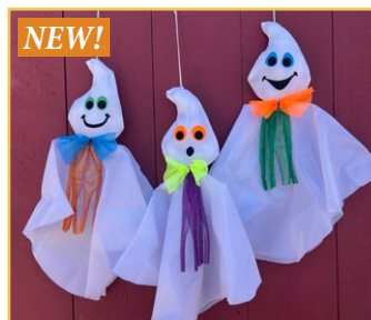
17" Cute Hanging Ghosts