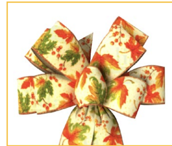
Autumn Leaves 6 Loop Bow