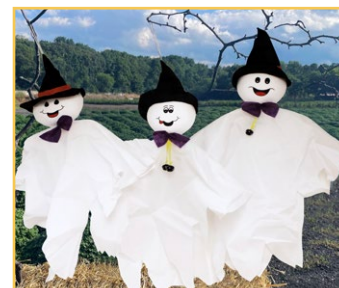
36" Hanging Ghosts