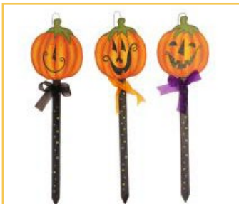
20" J-O-L Stake

Item No. 10-3085-10 Assortment of 3 | Pkg. 24 | $4.00