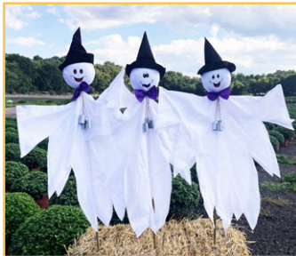
48" Ghost On Stake