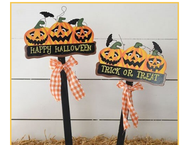
20" Triple J-O-L Pick

20" Item No. 10-3085-03 Assortment of 2 | Pkg. 24 | $2.00