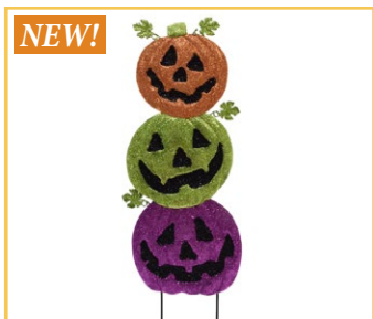
28" Tin Stacked Colorful