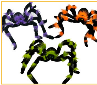
29" Furry Neon Spider

Item No. 10-3082-01 Assortment of 3 | Pkg. 6 | $6.50