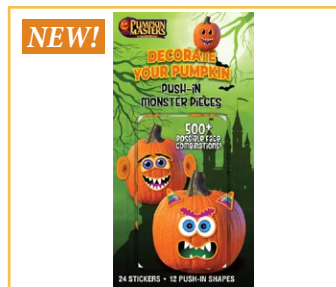
Decorate Your Pumpkin Kit