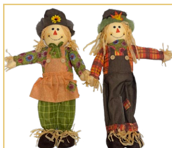
23.5" Standing Scarecrow