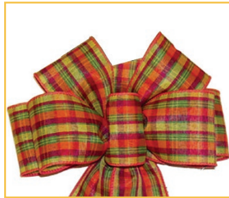
Harvest Plaid 6 Loop Bow