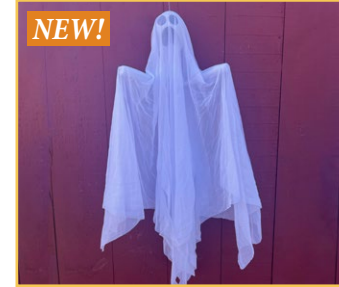
32" Hanging Ghost