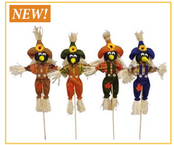
24" Crow Assortment

Item No. 10-3079-6 Assortment of 2 | Pkg. 12 | $4.50