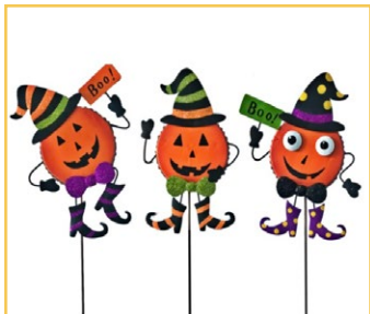
24" Tin J-O-L Pick

20" Item No. 10-3085-03 Assortment of 2 | Pkg. 24 | $2.00