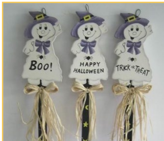
18" Purple Ghosts