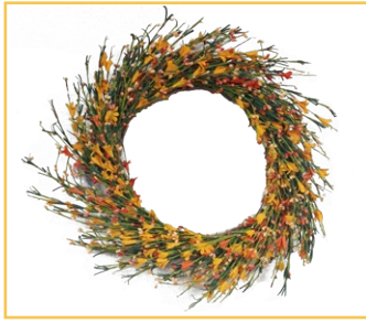
22" Pumpkin Buttercup Wreath