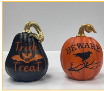
4.3" Halloween Resin Pumpkin

Item No. 10-3072-1 Assortment of 3 | Pkg. 12 | $3.50