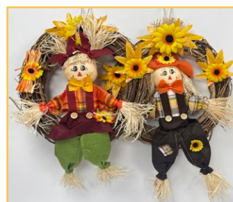
16" Scarecrow Wreath