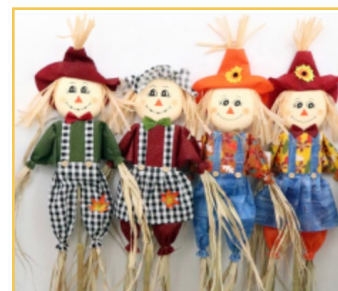
60" Scarecrow Assortment