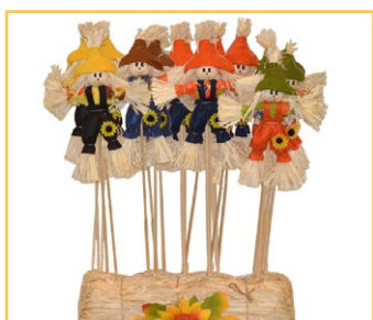
13" Pals in a Bale