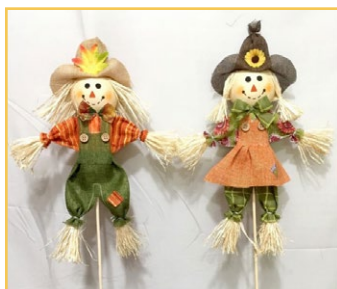
24" Scarecrow Pick