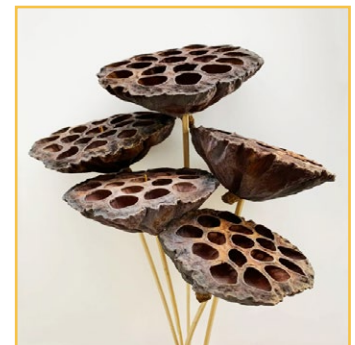
Natural Lotus Pods