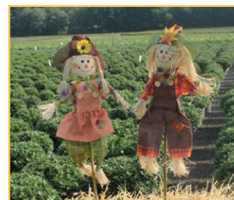
39" Scarecrow Pick