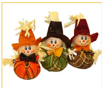
6" Mini Scarecrow