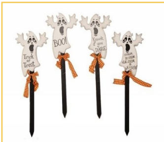
18" Curvy Ghosts