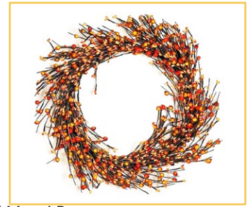
16" Mixed Berry Wreath