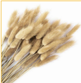
Lagurus Bunny Tails