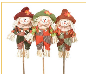
8" & 14" Patchwork Scarecrow