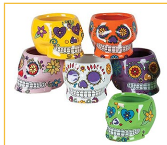
4" Skull Planter

Item No. 10-3083-01 Assortment of 6 | Pkg. 12 | $4.00