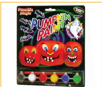
Pumpkin Magic Paint Kit