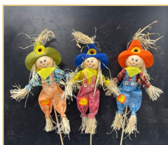
21" Scarecrow Pick