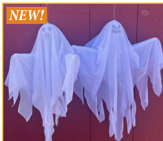
18" Hanging Ghosts