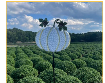
32" White Pumpkin Stake

Item No. 10-3085-04 Assortment of 3 | Pkg. 12 | $6.00