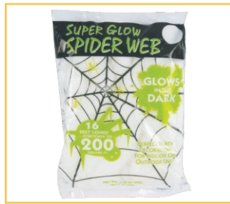
Super Glow Spider Web

Item No. 10-3082-01 Assortment of 3 | Pkg. 6 | $6.50