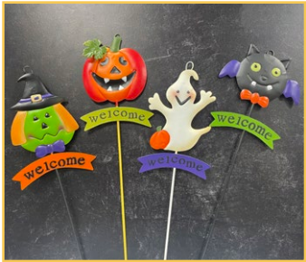
17" Tin Halloween Welcome Pick

Item No. 10-3079-4 Assortment of 4 | Pkg. 24 | $2.00