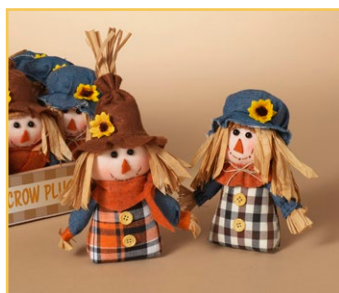
6" Plush Scarecrow