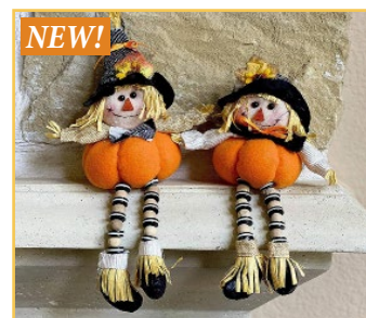
9" Plush Scarecrow Shelf Sitter