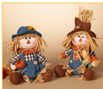
11" Plush Sitting Scarecrow