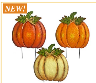
Tin Metal Pumpkins with Raffia Assortment

Item No. 10-3085-11 Assortment of 3 | Pkg. 12 | $10.00