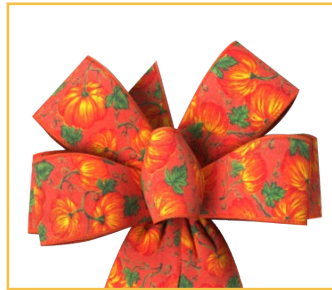
Pumpkin 6 Loop Bow