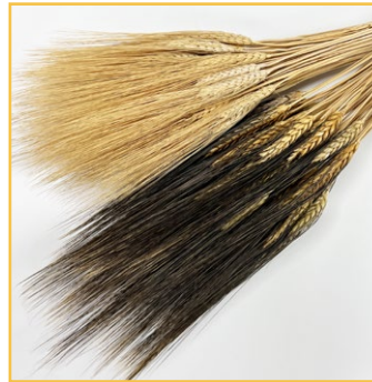
Natural & Bearded Wheat