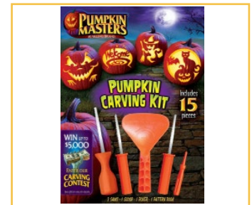
Pumpkin Carving Kit