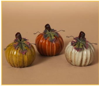
3.2"H Ceramic Harvest Pumpkin with Metal Leaf

Item No. 10-3072-1 Assortment of 3 | Pkg. 12 | $3.50