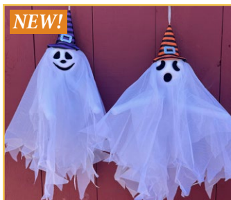
27" Ghost with Hat