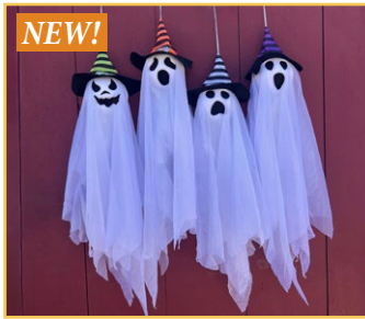
28" Hanging Ghost with Hat Asst.