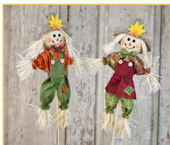
13" Scarecrow Pick