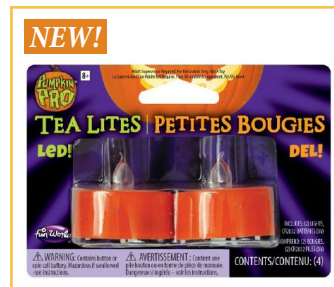
LED Pumpkin Tea Lites-2 pk