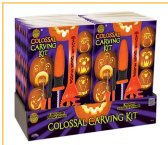
Colossal 10 Piece Carving Kit