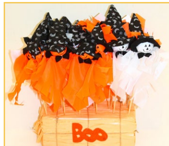
12" Halloween Pick in Bale

Item No. 10-3063-5 Assortment of 3 | Pkg. 24 | $2.00