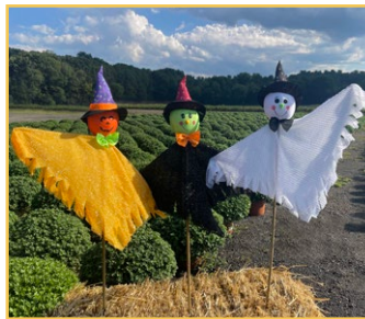
39" Halloween Stake