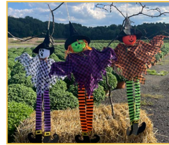
32" Halloween Hanging Asst. with Legs