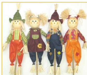
39" Scarecrow on a Pole