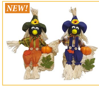
12" Crow with Bale

Item No. 10-3073-6 Assortment of 2 | Pkg. 12 | $3.50