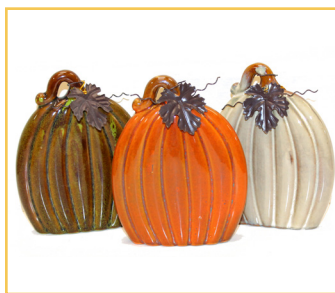
5.8" Harvest Pumpkin (Metal Leaf)

Item No. 10-3073-3 Assortment of 3 | Pkg. 6.....$5.00