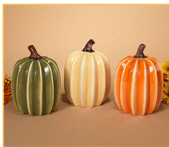
3.75" Harvest Pumpkin

Item No. 10-3073-3 Assortment of 3 | Pkg. 6.....$5.00