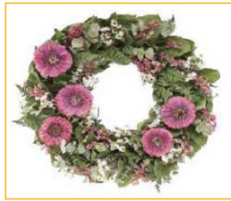
18" Rosie Zinnia's Wreath