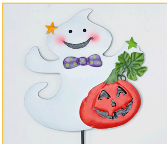
24" Metal Ghost with Pumpkin

18" - Item No. 10-3063-19 Assortment of 3 | Pkg. 24.....$2.00 30" - Item No. 10-3063-21 Assortment of 3 | Pkg. 24.....$5.00