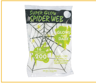
Super Glow Spiderweb