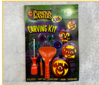
Kids Carving Kit