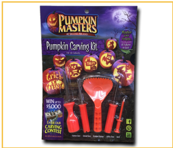
Pumpkin Carving Kit