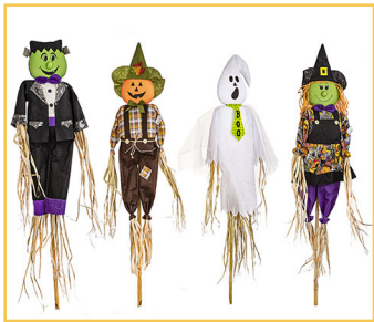
5' Halloween Characters

Item No. 10-3085-05 Assortment of 3 | Pkg. 24.....$3.50