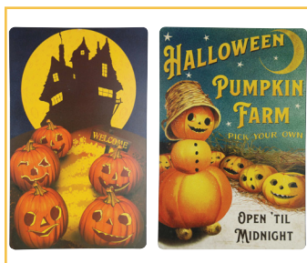
15" Metal Pumpkin Sign

Item No. 10-3100-15 Assortment of 2 | Pkg. 12.....$4.00