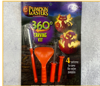
360° Carving Kit