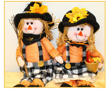
18" Plush Sitting Scarecrow

Item No. 10-3070-1 Assortment of 2 | Pkg. 12.....$8.50