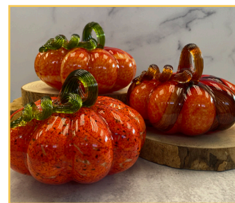
6.7" Hand-blown Glass Pumpkin

Item No. 10-3073-1 Assortment of 3 | Pkg. 9.....$3.50