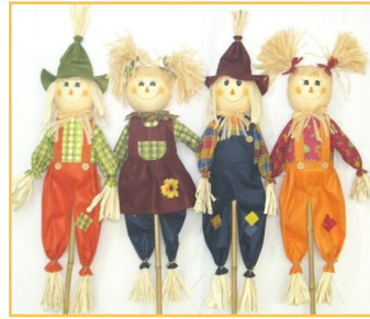
39" Scarecrow on a Pole

8" - Item No. 10-3078-9 | Pkg. 24 Assortment of 3.....$2.00 14" - Item No. 10-3078-2 | Pkg. 18 Assortment of 3.....$2.75