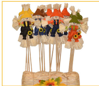
13" Pals in a Bale

Item No. 10-3080-02 Assortment of 6 | Pkg. 24.....$1.75