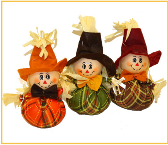
6" Mini Scarecrow

Item No. 10-3070-2 Assortment of 2 | Pkg. 6.....$10.00