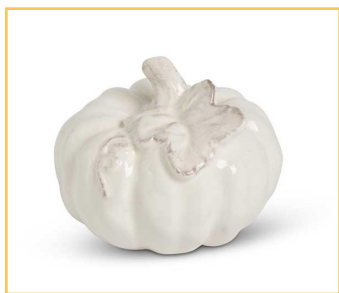
3" Cream Pumpkin Ceramic