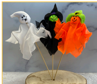
12" Halloween Pick

Item No. 10-3082-1 Assortment of 3 | Pkg. 24.....$1.25