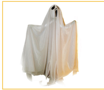
32" Hanging Ghost

Item No. 10-3076-1 Assortment of 3 | Pkg. 12.....$3.50