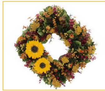
16" Sunflowers of Tuscany Wreath