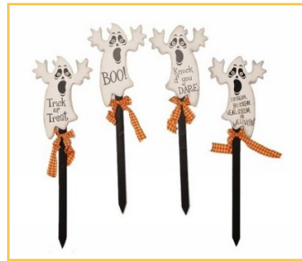
18" Curly Ghosts

18" - Item No. 10-3063-18 Assortment of 4 | Pkg. 24.....$1.50