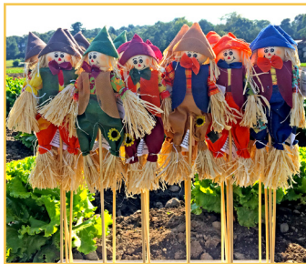
18" Happy Face Scarecrow Pick

Item No. 10-3080-07 Assortment of 2 | Pkg. 24.....$4.00