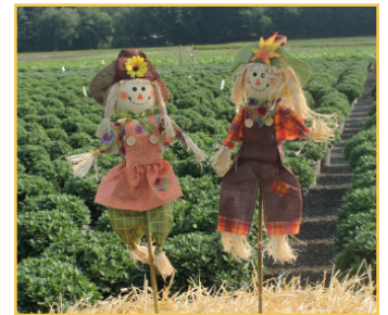
39" Scarecrow Pick

18" - Item No. 10-3080-06 | Pkg. 24 Assortment of 2.....$1.50 24" - Item No. 10-3080-11 | Pkg. 24 Assortment of 2.....$2.00