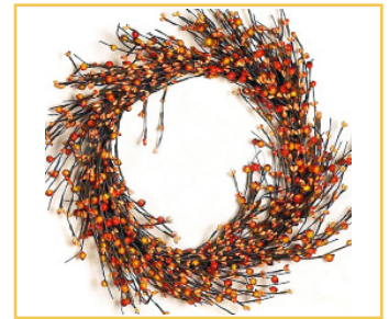
16" Mixed Berry Wreath