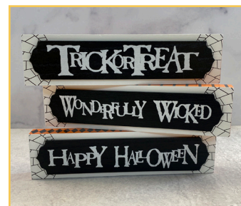
Halloween Table Top Signs

Item No. 10-3074-5 Assortment of 3 | Pkg. 12.....$4.50