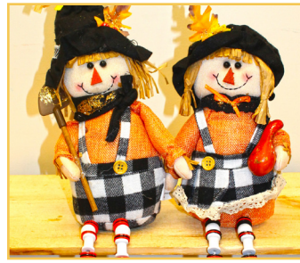
15" Plush Scarecrow Shelf Sitter

Item No. 10-3070-3 Assortment of 2 | Pkg. 12.....$9.00