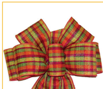
Harvest Plaid 6 Loop Bow

Wilson Farm, open year-round, has been run by the Wilson Family in the same location for 136 years. We strive to offer you the best wholesale products & service of the season. Price good while supplies last.