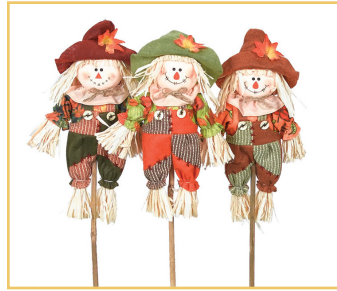
8" & 14" Patchwork Scarecrow

8" - Item No. 10-3078-9 | Pkg. 24 Assortment of 3.....$2.00 14" - Item No. 10-3078-2 | Pkg. 18 Assortment of 3.....$2.75