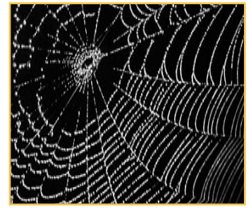
White Stretchy Spiderweb