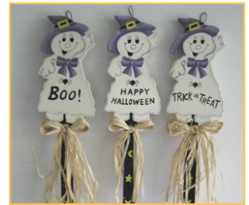
18" & 30" Purple Ghosts

18" - Item No. 10-3063-18 Assortment of 4 | Pkg. 24.....$1.50