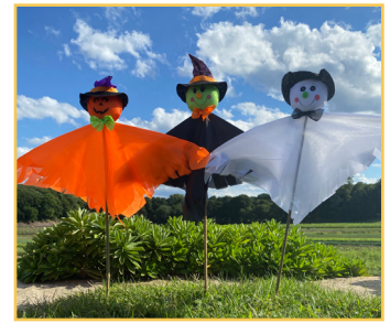
39" Halloween Stake

Item No. 10-3077-5 Assortment 3 | Pkg. 24.....$4.50