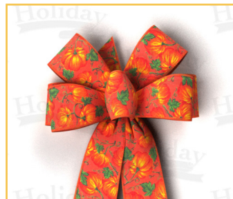
Pumpkin 6 Loop Bow