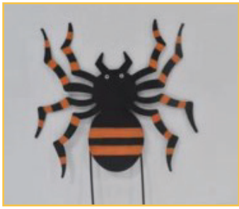
Tin Spider Yard Art

Item No. 10-3084-03 Assortment of 2 | Pkg. 12.....$6.50