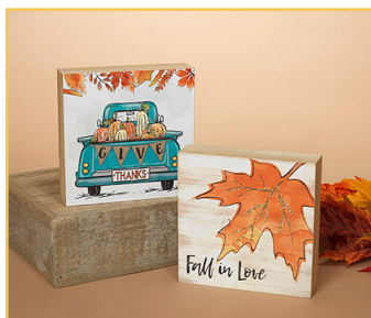
5.9" Wood Fall Block

Item No. 10-3074-2 Assortment of 2 | Pkg. 8.....$2.25