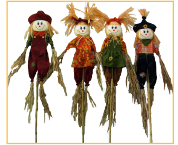
60" Scarecrow on a Pole

Item No. 10-3080-12 Assortment of 4 | Pkg. 24.....$4.00