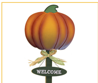
30" Welcome Pumpkin Stake

Item No. 10-3093-2 Assortment of 3 | Pkg. 12.....$4.50