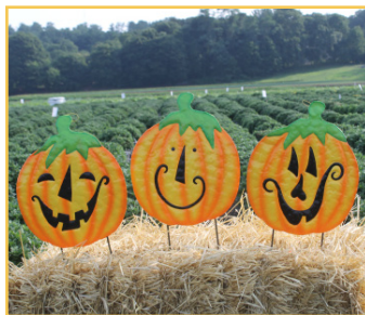
Tin J-O-L Yard Art

20" - Item No. 10-3085-01 Assortment of 3 | Pkg. 24.....$2.00 30" - Item No. 10-3085-02 Assortment of 3 | Pkg. 12.....$5.50