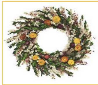
18" Graceful Garden Wreath