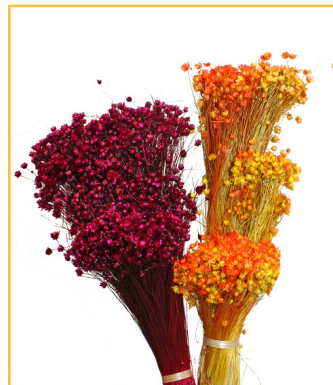
Cranberry & Harvest Campo Flowers