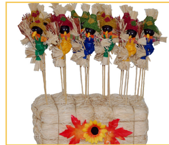
13" Crows in a Bale

Item No. 10-3079-2 Assortment of 4 | Pkg. 24.....$1.25