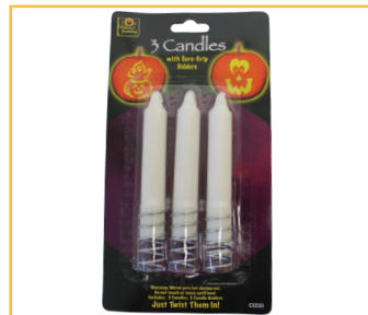
Pumpkin Magic Candles