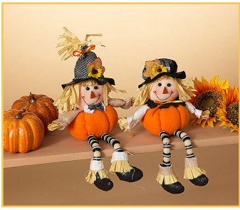
9" Plush Scarecrow Shelf Sitter

Item No. 10-3070-5 Assortment of 2 | Pkg. 12.....$5.00