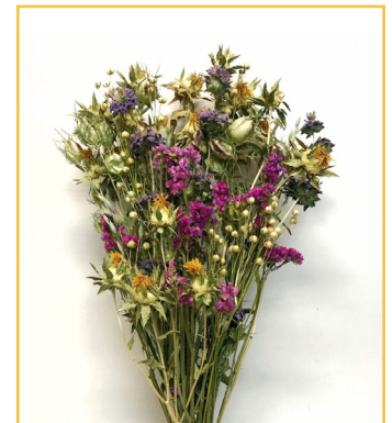
Happy Day Bouquet