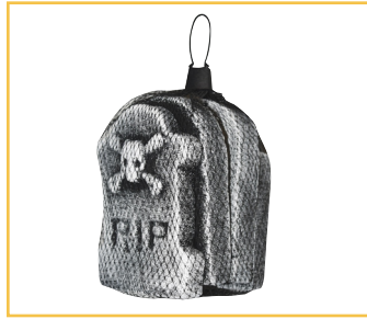
4-Pack Mini Tombstones