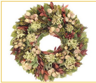
16" Fall Jewel Wreath