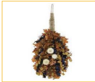
18" Spiced Autumn Charm