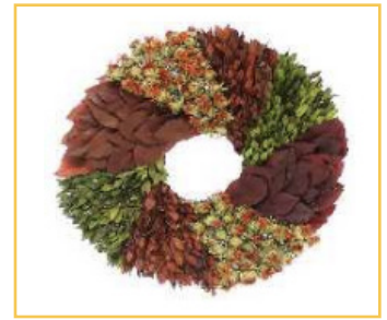
18" Bountiful Harvest Wreath