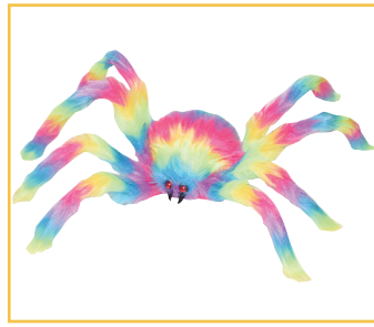
Colorful Light-Up Spider

Item No. 10-3084-03 Assortment of 2 | Pkg. 12.....$6.50