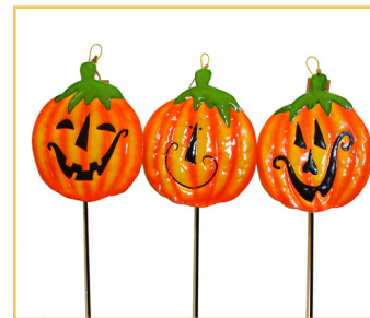
Tin J-O-L Stake

Item No. 10-3085-03 Assortment of 2 | Pkg. 24.....$2.00