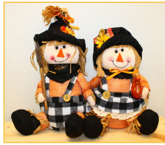
10" Plush Sitting Scarecrow

Item No. 10-3070-5 Assortment of 2 | Pkg. 12.....$5.00