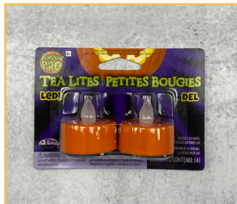
LED Tea Lights