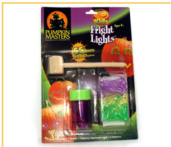
Kids Fright Lights