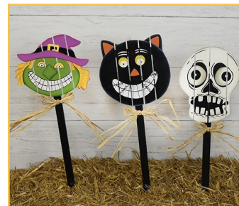
19" Funky Face Pick

Item No. 10-3082-1 Assortment of 3 | Pkg. 24.....$1.25