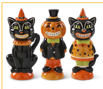
6.25" Vintage Halloween Figure

Item No. 10-3100-15 Assortment of 2 | Pkg. 12.....$4.00