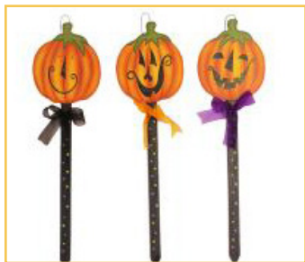
20" & 30" J-O-L Stake

Item No. 10-3073-4 Assortment of 3.....$15.00