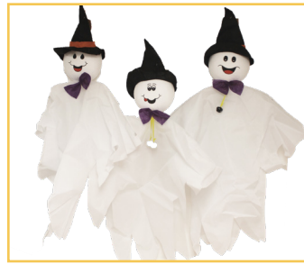
36" Hanging Ghosts

Item No. 10-3077-5 Assortment 3 | Pkg. 24.....$4.50