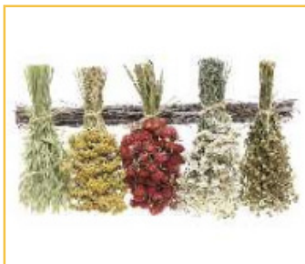
Strawberry Fields Hanger