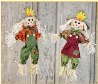
13" Scarecrow Pick

Item No. 10-3080-16 Assortment of 4 | Pkg. 12.....$6.00