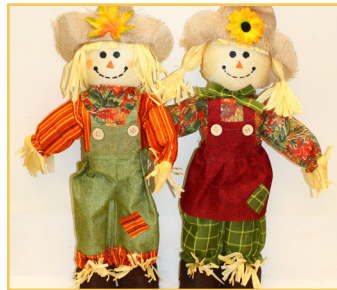
22" Standing Scarecrow

Item No. 10-3080-10 Assortment of 2 | Pkg. 24.....$1.00