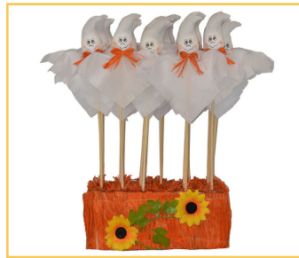
18' Ghost Picks in Bale

Item No. 10-3085-06 Assortment of 4 | Pkg. 8.....$7.50