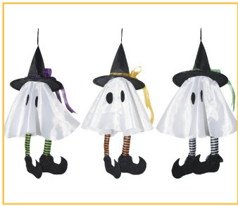
14" Hanging Ghosts with Hats

Item No. 10-3076-1 Assortment of 3 | Pkg. 12.....$3.50