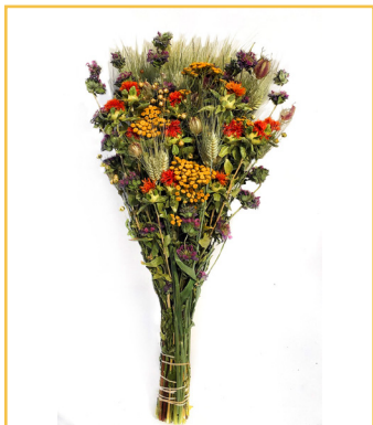
Fall Fantastic Bouquet