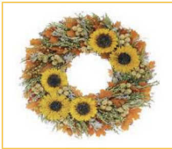
18" Sweet Morning Wreath