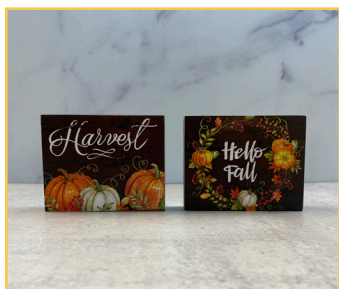
3.9" Harvest Design Block

Item No. 10-3074-4 Assortment of 3 | Pkg. 12.....$4.00