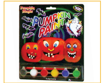
Pumpkin Magic Paint Kit