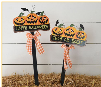
20" Triple J-O-L Pick

Item No. 10-3085-04 Assortment of 3 | Pkg. 12.....$5.50