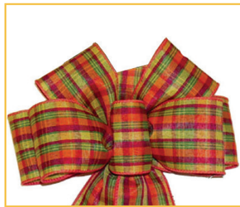
Harvest Plaid 6 Loop Bow