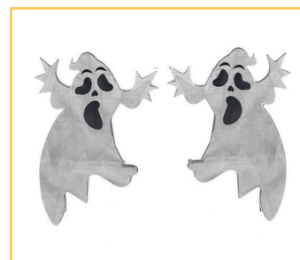
28" Mesh Screamer Ghost Item No. 10-3075-10 Assortment of 2 | Pkg. 12.....$6.50