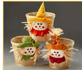
6" Woodchip Bushel Basket with Scarecrow Design

Item No. 10-3078-8 Assortment of 4 | Pkg. 24.....$1.25