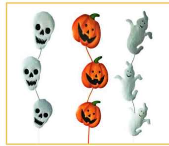
35" Tin Triple Lawn Stake

Item No. 10-3075-12 Assortment of 3 | Pkg. 12.....$5.00