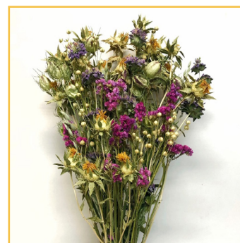
Happy Day Bouquet