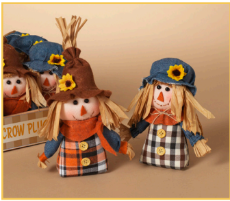
6" Plush Scarecrow

Item No. 10-3070-4 Assortment of 2 | Pkg. 12.....$3.50