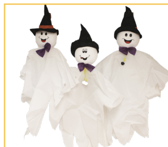
36" Hanging Ghosts Item No. 10-3077-5 Assortment 3 | Pkg. 24.....$4.50