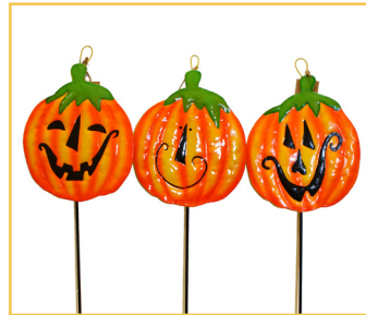
Tin J-O-L Yard Art Item No. 10-3085-04 Assortment of 3 | Pkg. 12.....$5.50