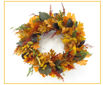
Harvest Wreath 2