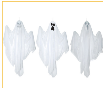
18" Mini Hanging Ghost Assortment Item No. 10-3077-3 Assortment of 3 | Pkg. 12.....$2.50