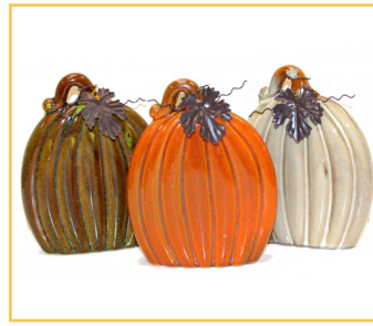
5.8" Harvest Pumpkin (Metal Leaf) Item No. 10-3073-1 Assortment of 3 | Pkg. 9.....$4.00