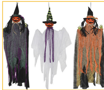
27" Hanging Pumpkin Scarecrow

Item No. 10-3079-9 Assortment of 1 | Pkg. 24.....$1.25