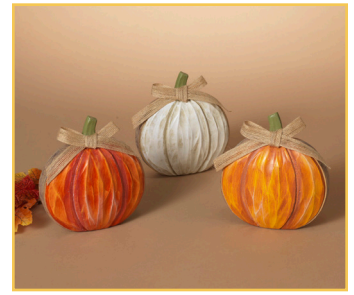
5.9"H Resin Harvest Pumpkin with Burlap Bow Item No. 10-3072-5 Assortment of 3 | Pkg. 6.....$6.00