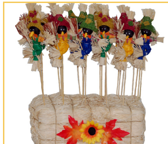
13" Crows in a Bale

Item No. 10-3079-2 Assortment of 4 | Pkg. 24.....$1.25