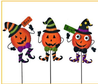
24" Tin J-O-L Pick Item No. 10-3075-1 Assortment of 3 | Pkg. 24.....$3.50