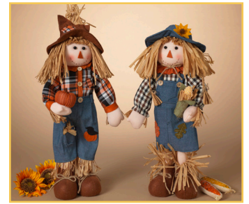
23" Plush Standing Scarecrow

Item No. 10-3070-1 Assortment of 2 | Pkg. 12.....$9.00