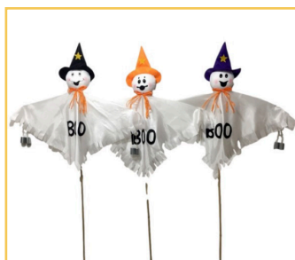
48" Ghosts On Stake Item No. 10-3075-11 Assortment of 3 | Pkg. 12.....$5.50