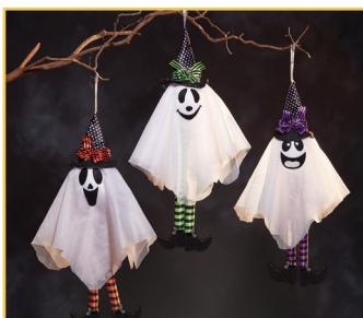
18" Hanging Friendly Ghosts Item No. 10-3077-1 Assortment of 3 | Pkg. 12.....$3.00