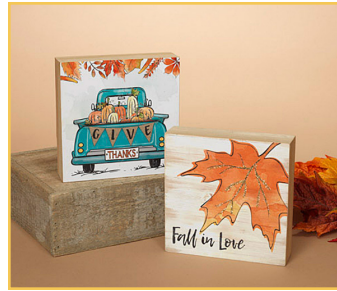
5.9" Wood Fall Block Item No. 10-3074-1 Assortment of 2 | Pkg. 6.....$5.00