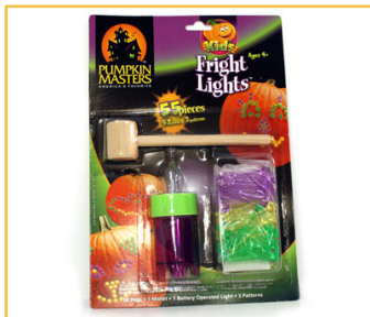
Kids Fright Lights