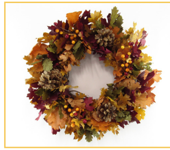
Harvest Wreath 1