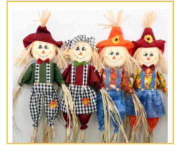
48" & 60" Scarecrow Assortment

Item No. 10-3080-12 Assortment of 4 | Pkg. 24.....$4.00