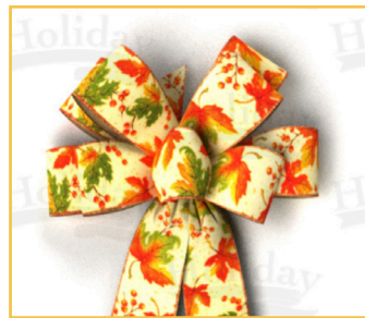
Autumn Leaves 6 Loop Bow