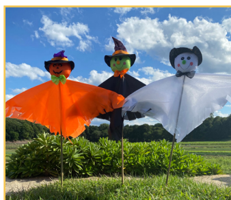
39" Halloween Stake Item No. 10-3085-05 Assortment of 3 | Pkg. 24.....$4.00