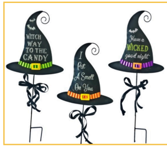
27.3" Tin Witch Hat Lawn Stake

Item No. 10-3084-03 Assortment of 2 | Pkg. 12.....$6.50