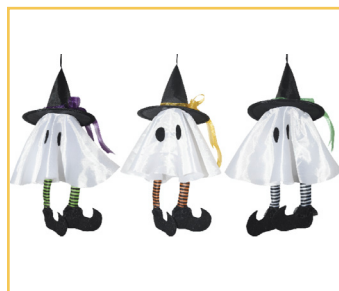
14" Hanging Ghosts with Hats Item No. 10-3076-1 Assortment of 3 | Pkg. 12.....$3.50