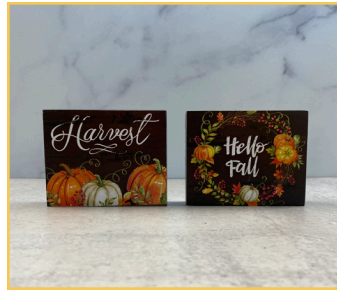
3.9" Harvest Design Block Item No. 10-3074-2 Assortment of 2 | Pkg. 8.....$2.50