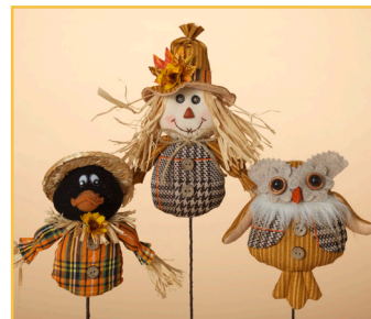
15"H Plush Harvest Figurine Pick Item No. 10-3070-5 Assortment of 3 | Pkg. 18.....$4.50

Be sure to check out our Ornamental Harvest Catalog! This colorful catalog is filled to the brim with unique pumpkins and squashes!