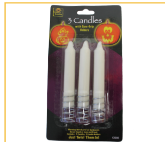
Pumpkin Magic Candles