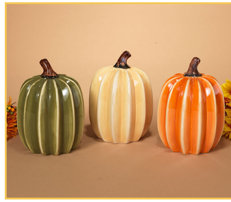
3.75" Harvest Pumpkin Item No. 10-3073-3 Assortment of 3 | Pkg. 6.....$6.00