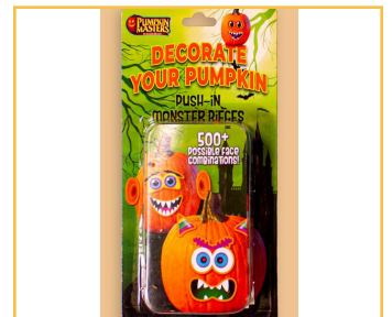
Push-In Monster Pieces