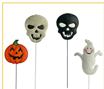
17" Tin Ghost, Skull, Pumpkin JOL Pick Assortment Item No. 10-3075-3 Assortment of 4 | Pkg. 24.....$2.00