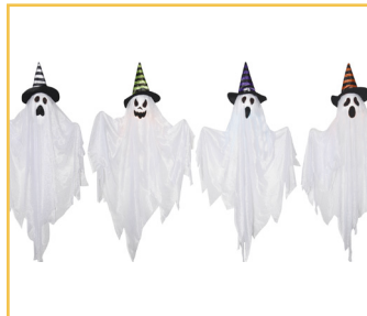
28" Hanging Ghost Assortment Item No. 10-3076-2 Assortment of 4 | Pkg. 12.....$4.00