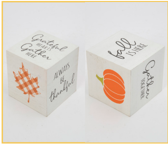
3.54"L Six-Sided Wood Harvest Block Item No. 10-3073-9 Pkg. 6.....$5.00