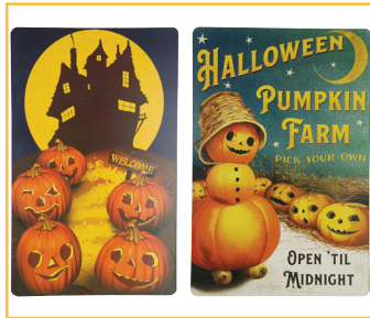
15" Metal Pumpkin Sign Item No. 10-3100-15 Assortment of 2 | Pkg. 12.....$4.50