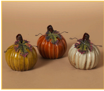
3.2"H Ceramic Harvest Pumpkin with Metal Leaf Item No. 10-3072-1 Assortment of 3 | Pkg. 6.....$4.00