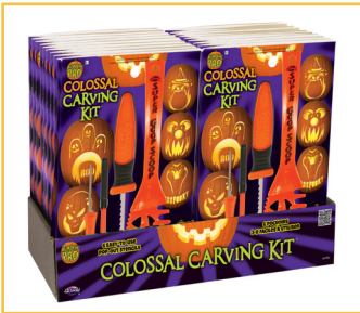
Colossal 10 Piece Carving Kit