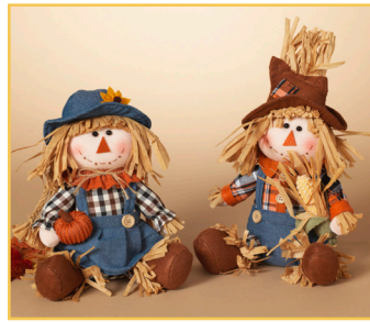
11" Plush Sitting Scarecrow

Item No. 10-3070-4 Assortment of 2 | Pkg. 12.....$3.50