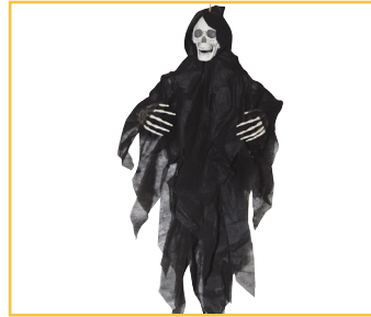
30" Hanging Black Reaper