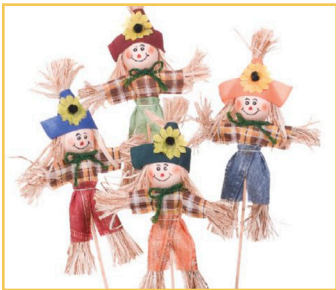
8" Scarecrow Pick

48" - Item No. 10-3080-14 | Pkg. 24 Assortment of 4.....$4.00 60" - Item No. 10-3080-16 | Pkg. 12 Assortment of 4.....$5.50