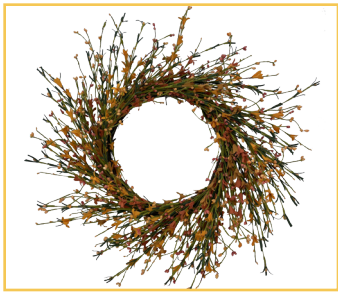
22" Cinnamon Buttercup Wreath