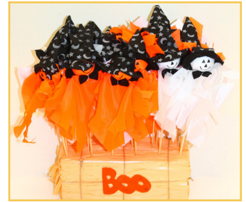
12" Halloween Pick in Bale Item No. 10-3082-1 Pkg. 24.....$1.50