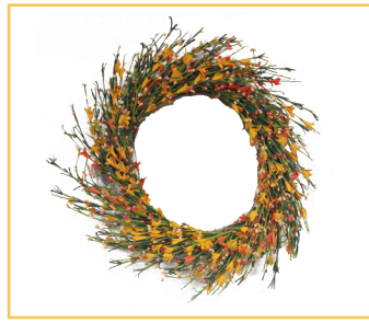
22" Pumpkin Buttercup Wreath