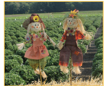
39" Scarecrow Pick

24" - Item No. 10-3080-11 Assortment of 2 | Pkg. 24.....$2.00