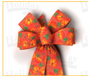
Pumpkin 6 Loop Bow