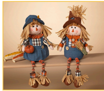
15" Plush Scarecrow Shelf Sitter

Item No. 10-3070-3 Assortment of 2 | Pkg. 12.....$10.00