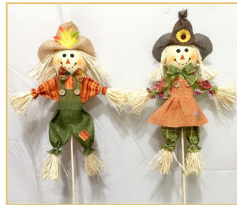
24" Scarecrow Stake

Item No. 10-3075-8 Assortment of 3 | Pkg. 6.....$5.00