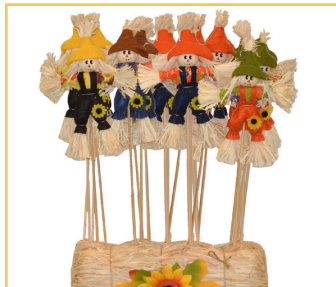
13" Pals in a Bale

Item No. 10-3080-07 Assortment of 2 | Pkg. 24.....$4.00