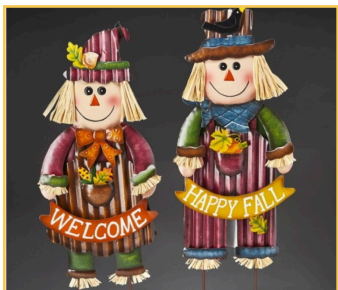
27.8" Metal Scarecrow Stake Item No. 10-3085-2 Assortment of 2 | Pkg. 6.....$7.50