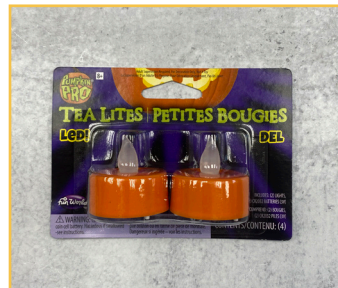
LED Tea Lights